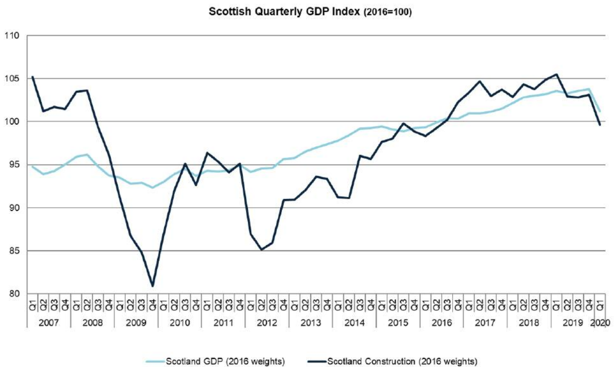
Figure 2: Scotland GDP & Scotland Construction GDP

The data suggests that the negative forecast for the wider economy in the medium term is likely to be magnified within the construction sector and there are a number of uncertainties around how badly the economy and subsequently the construction sector will be effected. This recovery plan has been developed to be dynamic and respond to the uncertainties ahead. Where required, the priorities and range of activities will be adjusted to best support the needs of the industry going forward.